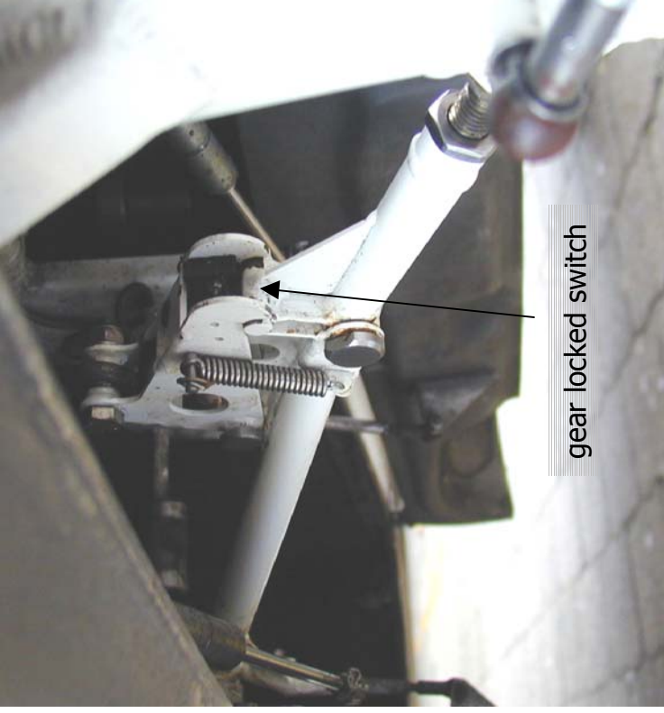
gear locked switch