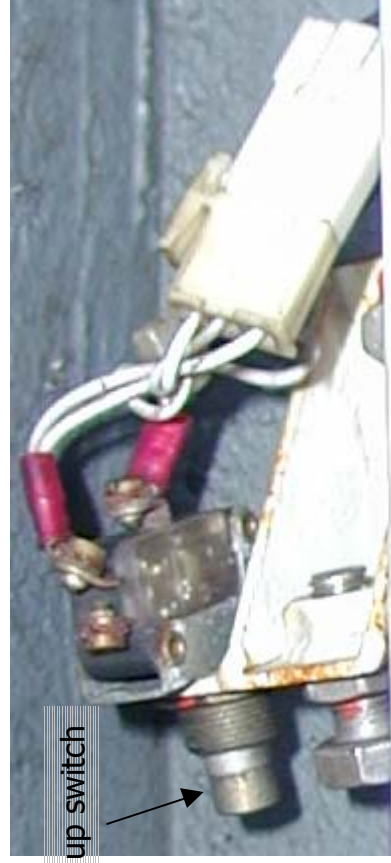
gear up switch