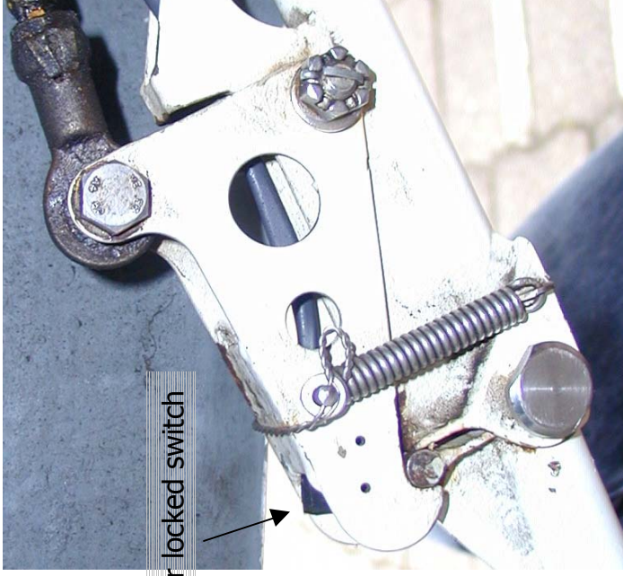
gear locked switch